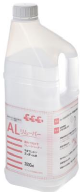
2000 ml plastic bottle

AL Remover is a liquid tray cleaner that shrinks alginate impression material, allowing it to be easily peeled off. It does not dissolve the alginate impression material, enabling fast processing. It leaves no residue, has a long lifespan, and also offers antibacterial properties.