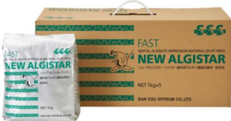
5kg box (1kg aluminum bags × 5)

Dental alginate impression material available in powder form, with two types differing in working time. Minimizes powder dispersion, easy to mix, with a smooth finish that adapts to various plasters. It does not sag in the oral cavity and is easy to remove after setting, making it friendly for both users and patients.