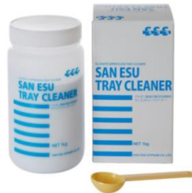
1kg poly bottle (comes with one measuring spoon)

San Esu Tray Cleaner is a powerful tray cleaner developed with the goal of being more efficient and providing a cleaner result.