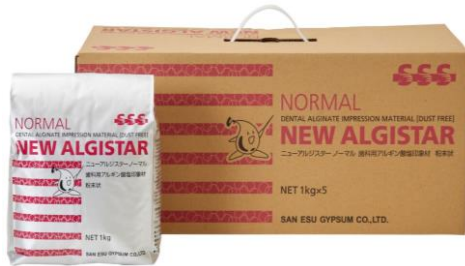
5kg box (1kg aluminum bags × 5)